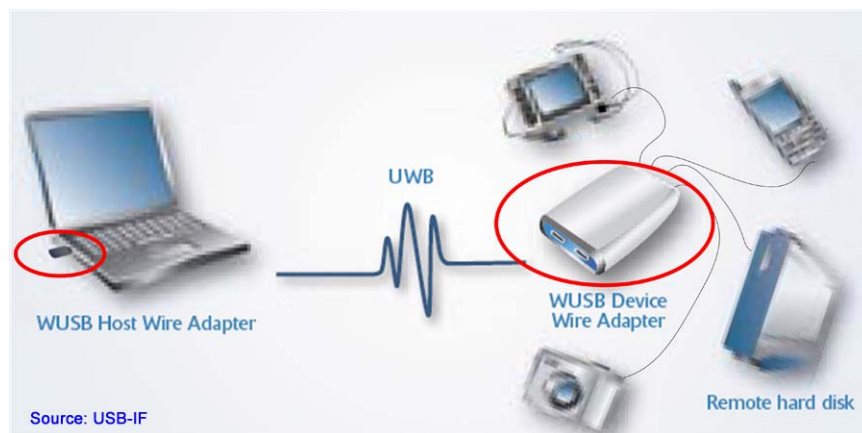
HWAs and DWAs bridge wired USB to Wireless USB

The Certified Wireless USB specification provides details of two transitional devices that bridge wired USB to wireless USB. The Host Wire Adapter (HWA) is a dongle that plugs into the existing wired USB port of a PC. This adds wireless USB host capability to that PC. The Device Wire Adapter (DWA) contains ports for plugging in existing wired USB peripherals. The DWA wirelessly connects to the wireless USB host and routes traffic to and from the wired USB peripherals. Most DWAs can attach to multiple wired USB peripherals.